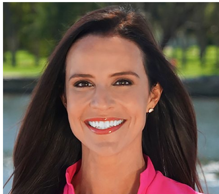
Mistress of Ceremonies: Courtney Robinson Anchor - 10 Tampa Bay